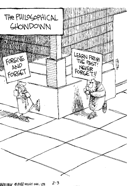
WILEY OZOZZ WILEY INK. LTD. 2-3 WILEY OLOTBY MORENS WHEEL SMOKATION WILEYINK BEARTHLINK, NET GOCOMICS.COM